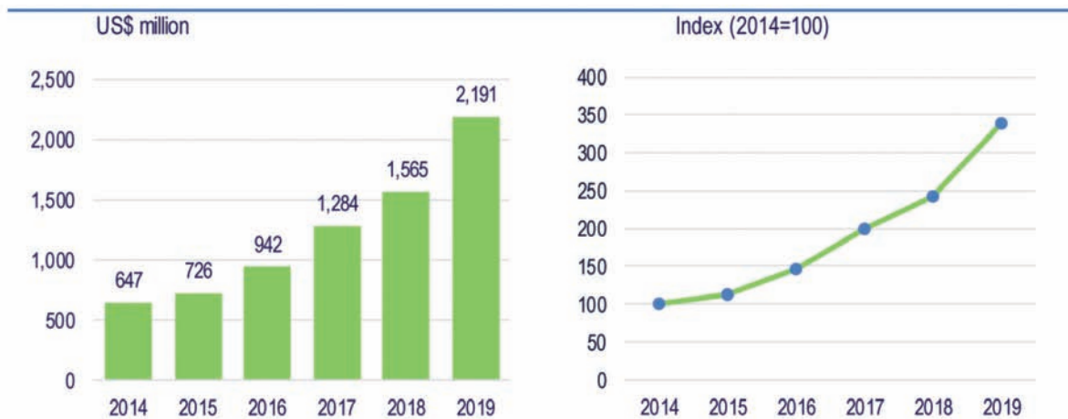
VIETNAM. UPHOLSTERED FURNITURE EXPORTS, 2014-2019. US$ MILLION AND INDEX (2014=100)

Source: CSIL processing of official data